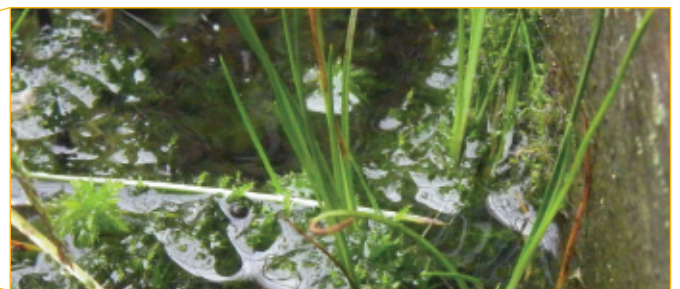
Figure 2: Sphagnum moss colonising the pool behind a timber dam on Kinder Scout