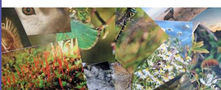
Photo competition shortlist