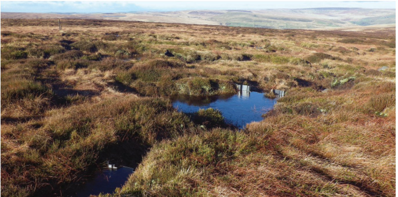
Figure 2: Plastic dams – several days after installation on Deer Hill Moss, February 2016

In February 2016, plastic dams were installed on West Nab and Deer Hill Moss to block shallow pans and gullies near the heads of watercourses. Figures 2 and 3 show some of the dams shortly after installation.