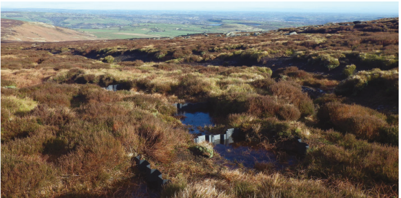
Figure 3: Plastic dams – several days after installation on Deer Hill Moss, February 2016