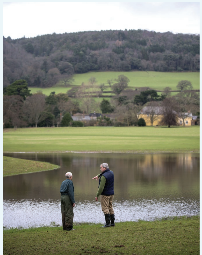
A flood storage area (Somerset project)

NFM impacts cannot therefore at present be evaluated in the purely quantitative way we might assess an engineering intervention.