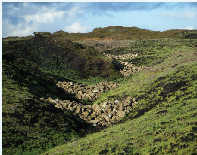
Stone gully blocks and early stage re-vegetation (Derbyshire project)

It can be shown that the total value of the flood risk reduction and other benefits arising from these projects substantially outweigh the total costs involved in implementation.