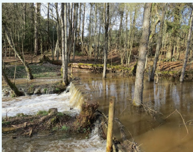
A woody dam (North Yorkshire project)